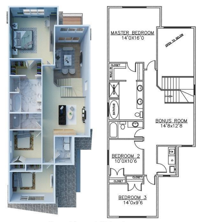
Upper Floor - 1147 sq.ft.

DATA IS DEEMED RELIABLE BUT IS NOT GUARANTEED ACCURATE BY THE REALTORS® ASSOCIATION OF EDMONTON. COPYRIGHT 2025 BY THE REALTORS® ASSOCIATION OF EDMONTON. ALL RIGHTS RESERVED. Trademarks are owned or controlled by the Canadian Real Estate Association (CREA) and identify real estate professionals who are members of CREA (REALTOR®, REALTORS®) and/or the quality of services they provide (MLS®, Multiple Listing Service®)