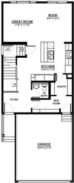
MAIN FLOOR 759 SQ.FT (9 FT. CEILINGS)