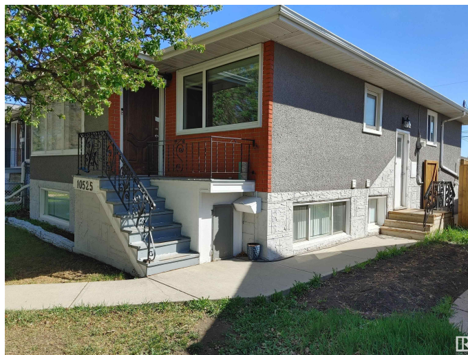
10525 63 Ave, Edmonton

TURNKEY INVESTMENT OPPORTUNITY! RAISED BUNGALOW WITH INDEPENDENT 2 BEDROOM IN-LAW SUITE (SEPARATE ENTRY) WITH 9 LARGE ABOVE GRADE WINDOWS! DESIRABLE ALLENDALE LOCATION! Renovated from top to bottom including 2 newer kitchens boasting loads of extended height modern cabinets, lots of countertop space, tile backsplash & upgraded appliances, 2 renovated 4-pce baths, newer flooring (vinyl plank, ceramic tile & carpet), all newer vinyl windows (except one), newer paint on main floor & exterior, newer light fixtures, interior & exterior doors, casing & baseboards, 100 amp electrical with newer panel, plugs & switches, newer PEX piping & plumbing fixtures, back flow valve, hi-eff furnace & water heater, newer roof, sidewalks, patio, fence, sewer line, aluminum fascia, soffits & eaves, upgraded attic insulation, etc. The yard is landscaped and there is an oversized single garage with parking, in back, for 4 cars. Lovely, renovated home in great area close to U of A, downtown, schools, parks & all amenities.